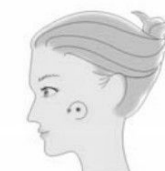
massage around acne